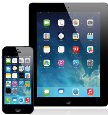
iOS tablets & phones