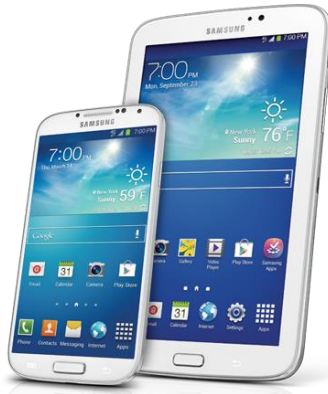
Android tablets & phones